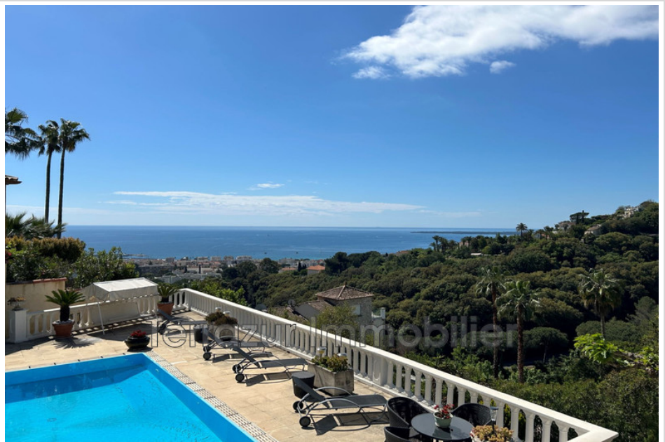
Villa 1008 Golfe-Juan

Ref 03 2056 Nestled on the hill of Golfe-Juan, come and discover this superb detached villa of 230 m 2 on two levels. South-west facing, offers a magnificent view of the sea and the hills. It is composed on the ground floor of a spacious living room of 46 m 2 , a fully equipped independent kitchen, two bedrooms, dressing room and bathroom all overlooking a large beach with swimming pool and pool house. On the 1st floor: an office, a laundry room, three bedrooms, a bathroom, a shower room. The whole is built on a pleasantly landscaped plot of 1525 m 2 . Carport and parking for 4 cars. For more information and request for a visit, contact Diana at: 0698164150.